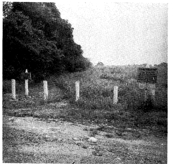
No Trespassing—Prettyboy Reservoir Area Key No. 8

mits practically unlimited recreational activities including swimming, motorboating, sailing, iceboating, ice skating and private cottage developments. The Illinois State Department of Health reports that, with proper controls, no detrimental effects on water quality or public health have resulted from such uses. In other areas of the country, practically no recreational use of reservoirs is allowed. Opinion among sanitary engineers and public health personnel regarding the degree to which such uses are permissible has not yet become consolidated, but as experience is gained and public attitudes change, there is a growing tendency to become more liberal in the approach to this problem.